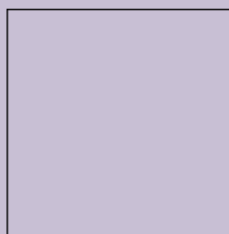
12" x 12" (305mm x 305mm)