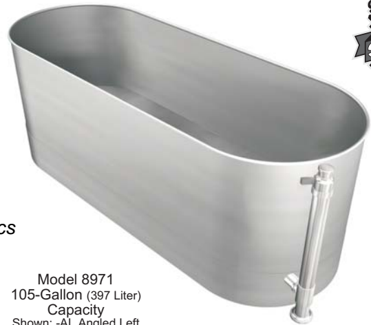
Model 8971 105-Gallon (397 Liter) Capacity Shown: -AL Angled Left